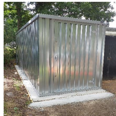
the replacement storage

Have you seen the shiny new storage container on the Recreation Ground which replaces the old, dilapidated garage? If not, look at the photo, It, as you are probably aware, has taken many months to complete, largely because of the pandemic. However, on Friday 13 August (not a bad omen we hope) it arrived and was lifted off the transporter by crane. It was flat packed and placed alongside the prepared base which had been completed the week before. Finally it was erected and is now fully functional. The added advantage was that it made the Council sort out all the rubbish that had accumulated over the years.