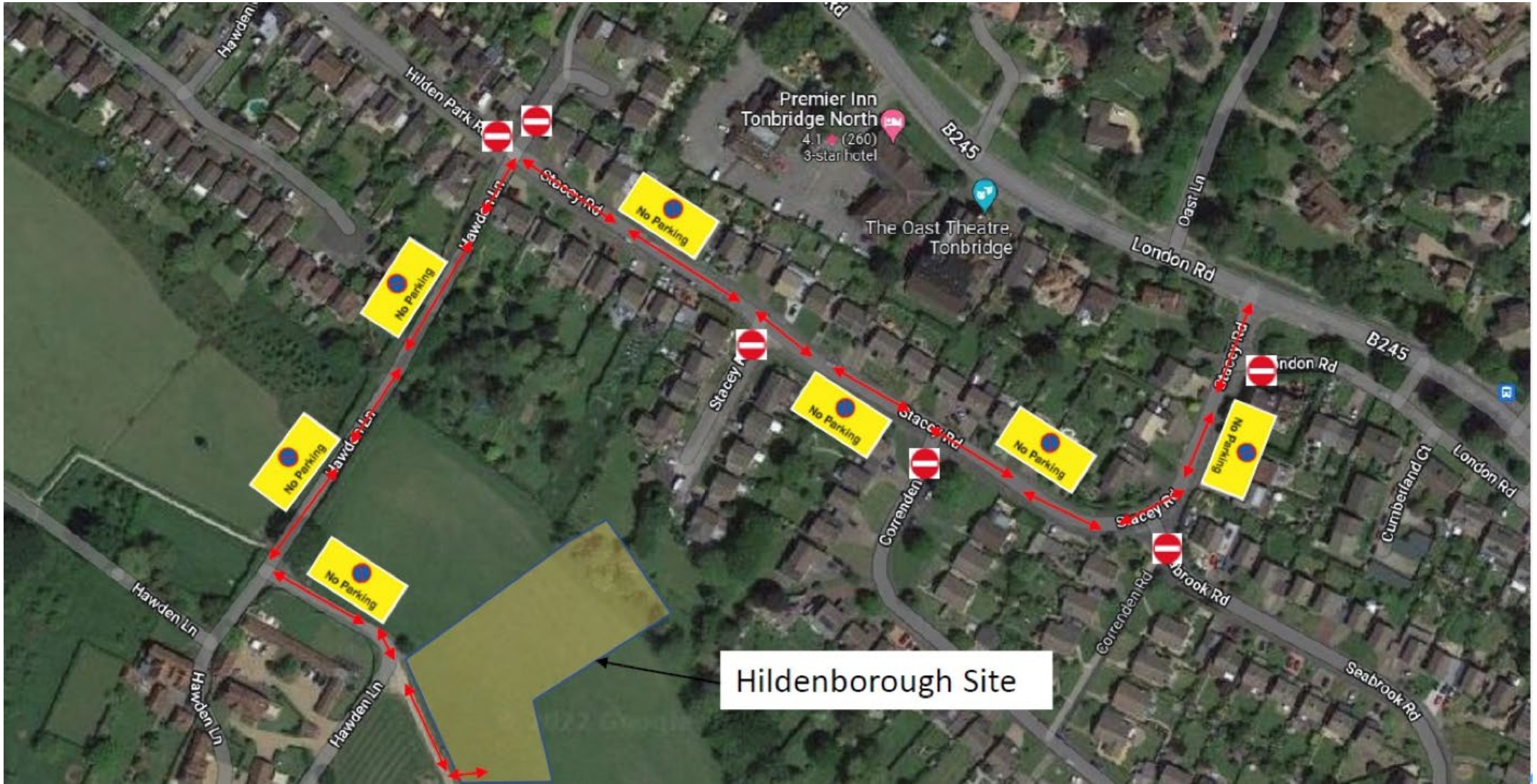
Above: Hildenborough embankment Traffic Management Plan

The No Entry and No Parking indicators apply only to delivery and site vehicles. Residents and the public can use the roads as usual.